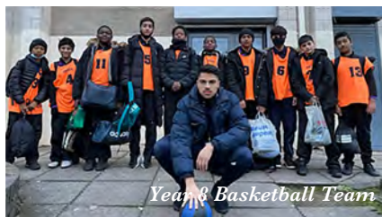
Year 8 Basketball Team

Eden Boys: 15 points Aston Manor Academy: 6 points