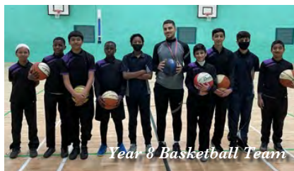
Year 8 Basketball Team

The Eden Boys' Year 8 basketball team were victorious in our away fixture against Aston Manor Academy.