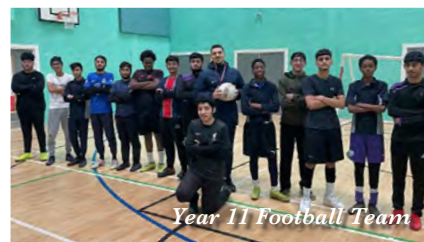
Year 11 Football Team

Eden Boys: 12 points Holte School: 2 points