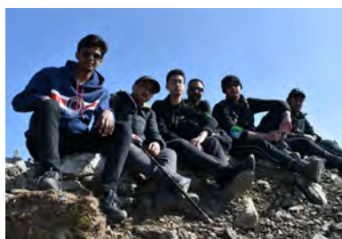
Part of Star www.staracademies.org