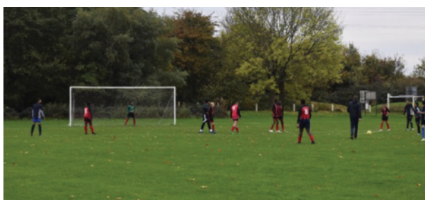
U15's Eden Boys' V St John Wall 26.10.2018