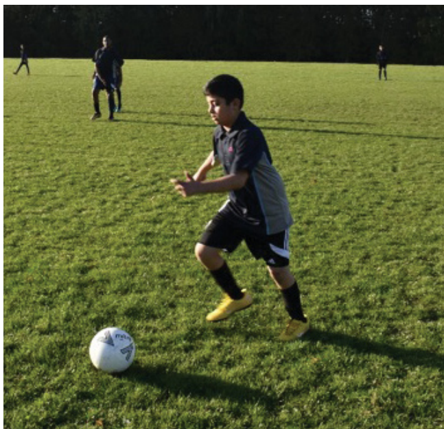
U13's Eden Boys' V King Solomon 22.10.2018

*Eid holiday may be revised slightly according to the sighting of the moon.