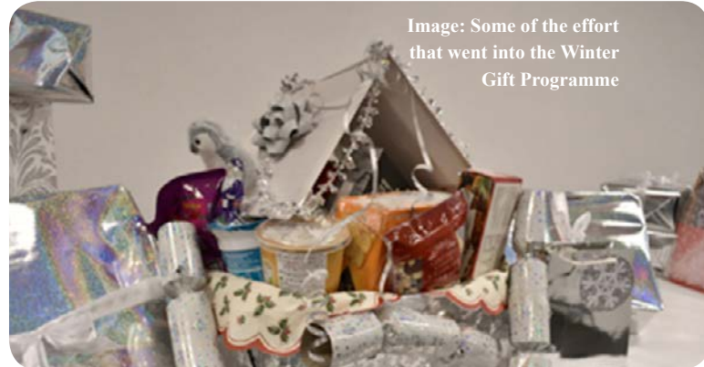
Image: Some of the effort that went into the Winter Gift Programme