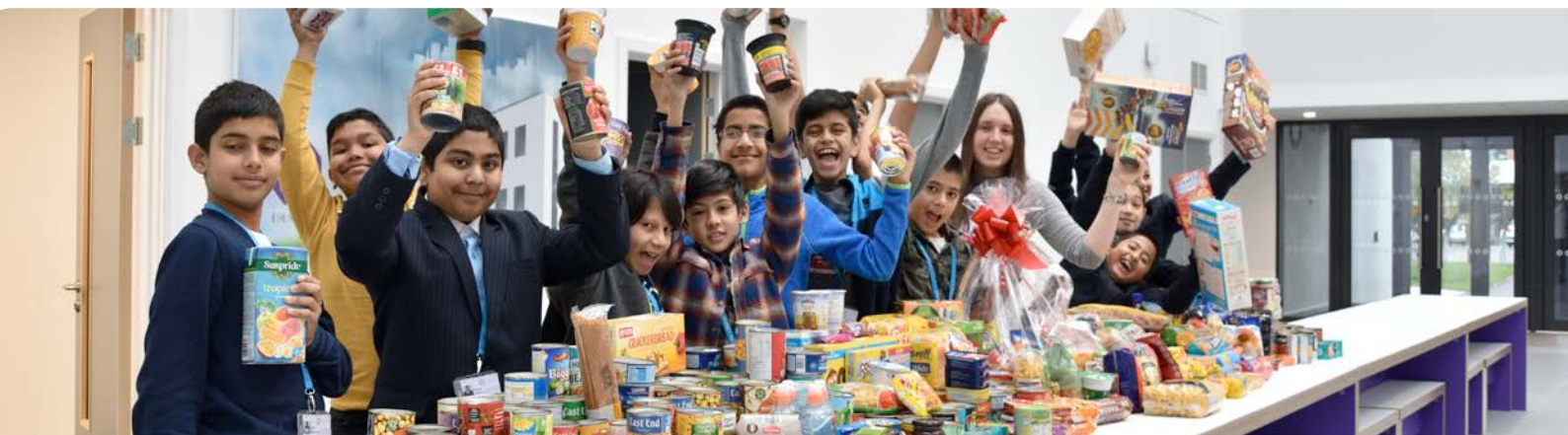
Image above: St Basils Harvest Festival